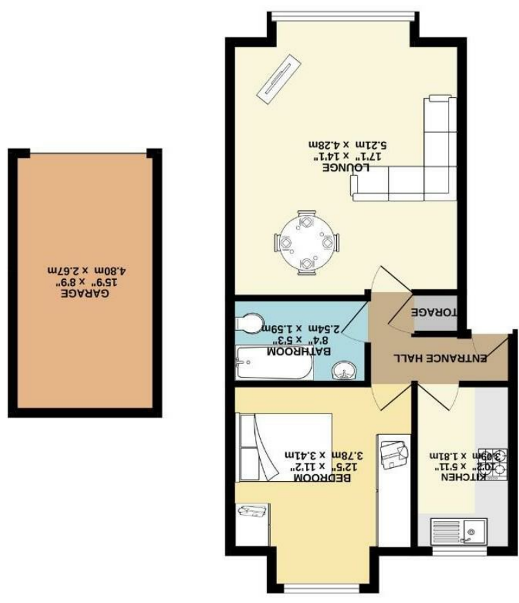
GROUND FLOOR 640 sq.ft. (59.5 sq.m.) approx.

TOTAL FLOOR AREA: 640 sq ft. (59.5 sq.m.) approx. Measurements are approximate. Not to scale. Brochure purposes only. Plans not to scale.